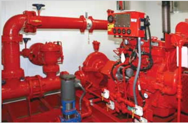
Typical housed diesel driven fire pump with test meter.