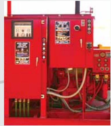
Controllers mounted and wired on diesel pump base.

Aurora Pump is a global manufacturer of pumps and systems for the commercial, municipal, industrial and fire protection markets. We provide the solutions to meet your pumping needs.